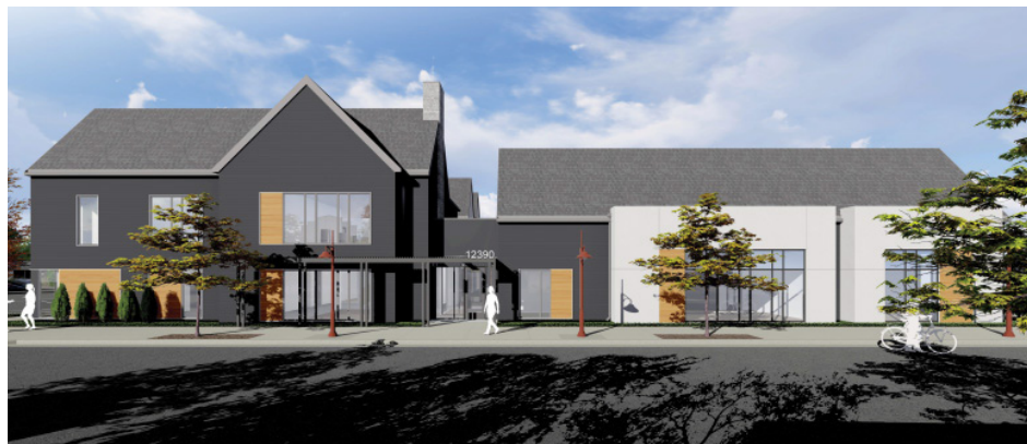
Rendering of new IRTS mental health and crisis facility in Savage

In its third year, Scott County Treatment Court has been giving non-violent offenders with addictions a second chance to change their lives and avoid incarceration. After assessments, it is determined that many of these individuals have an underlying mental health issue, and offenders are provided with a multidisciplinary strategic response consisting of treatment, wraparound services, support,