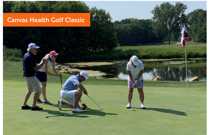
Canvas Health Golf Classic

From our all-staff event to our fantastic fundraisers, Canvas Health's special events shine a light on the beautiful supporters and staff who help make our agency so spectacular!