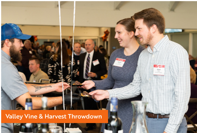
Valley Vine & Harvest Throwdown

In 2022, 49 Canvas Health staff members had 10 or more years of service, totaling 1,699,360 hours of service!